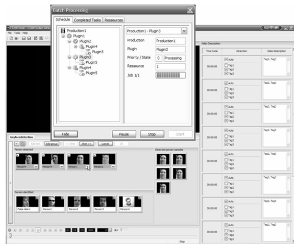
Fig. 3. Screen capture of the VDM beta version under development showing improved graphical user interaction.

We are now engaged in the second phase of the project which targets a pre-commercial tool with more user interactivity and versatility (Figure 3).